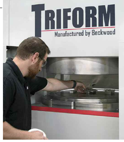
Weldmac's new press joins this 5000-psi sheet-hydroforming press, installed in early 2016, which doesn't require mated tooling or secondary finishing, yet yields complex, net-shaped parts.

MTI MONTERREY, MEXICO • CSP Equipment Inc., ONTARIO, CANADA • FOSMO & DELI A.S., OSLO, NORWAY Veugen Integrated Technologies Ltd., Ontario, Canada